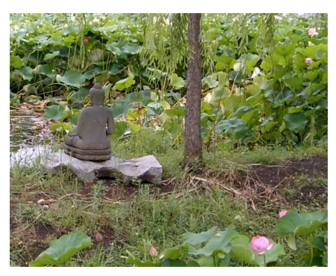
Garden at Nan Tien Temple, New South Wales, Australia